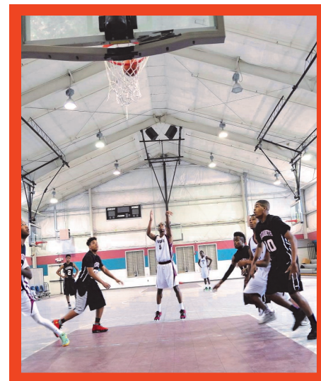
The PMBC Basketball team (in white) in action during a playoff game. Read more on page 5 about this amazing program.

You will see examples of our commitment and good works in this issue. We, as a family, should be very proud of our church and the direction we are going and the pace in which we are growing. God is blessing us everyday.