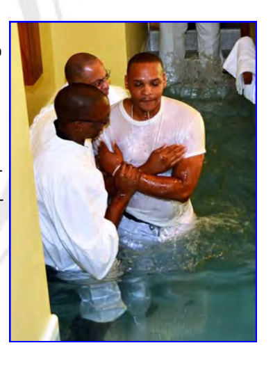
A chance to change directions.

God gives us the chance to always start over. He forgives us for all of our mishaps and misdeeds and allows us to confess our iniquities, and then His grace allows us to start on a new path.