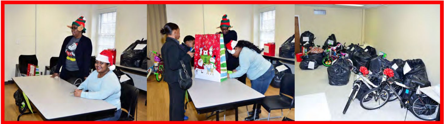
The True Spirit—Giving To Those in Need