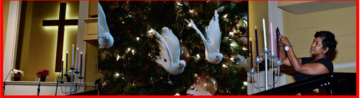
The True Meaning—The Advent and the Birth of Christ