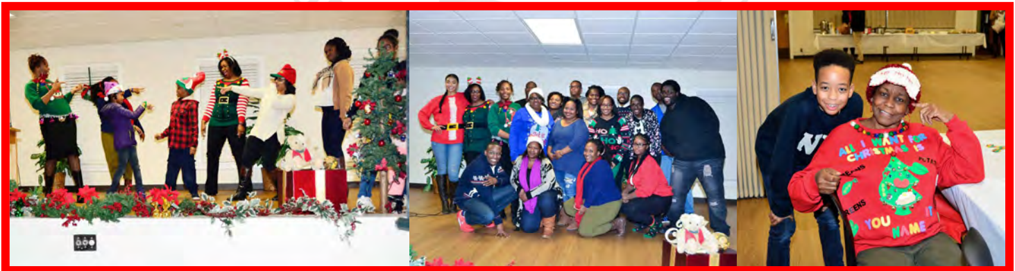
The True Joy—Singing and Fellowshiping

PMBC had a joyous Christmas Season. It was a mixture of emotions. From the very small to the elderly, all participated in the many activities planned. It was understood that giving to those in need and the birth of Christ is the primary reason for the season.