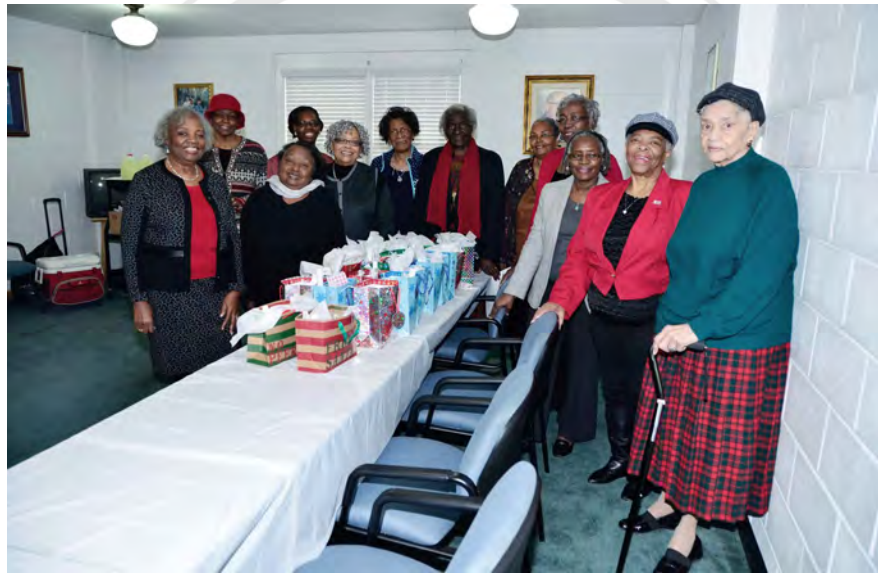
Matron's Circle members prepared bags for those in need.

Christmas packages to those who are ill and home-bound. Courtesies are also sent to acknowledge a death in the family and cards to celebrate a birthday. The Matrons' Circle meets on the second Sunday of each month, and any woman of Providence is welcome to join. All church members are encouraged to participate in any of these service projects. Look for future announcements regarding dates, times, and locations.