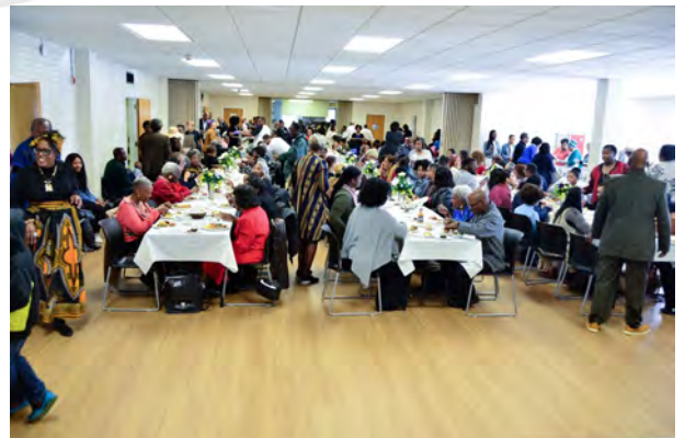
The Servers and the Great Food